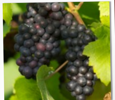
PINOT NOIR GRAPES