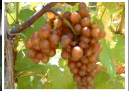
VINTAGE 2010 ACROSS THE SOUTH WEST IS GOOD!